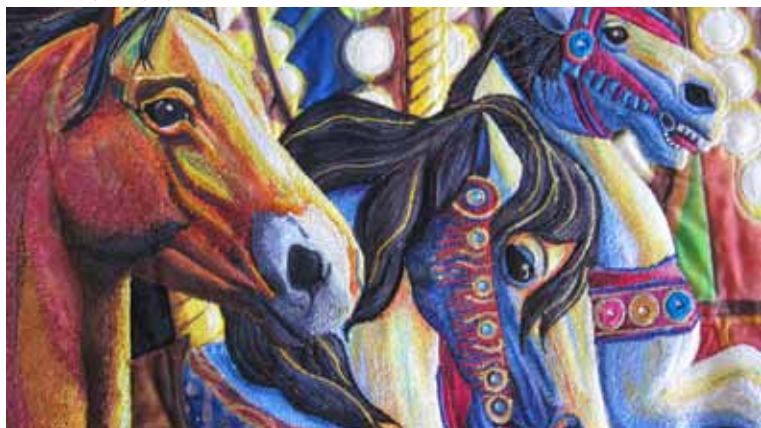
Carousel (detail) by Yvonne Chapman, Australia