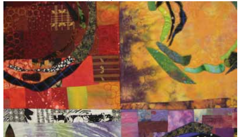
The Wilderness Shall Be Glad (detail) by Niza Hoffman, Israel